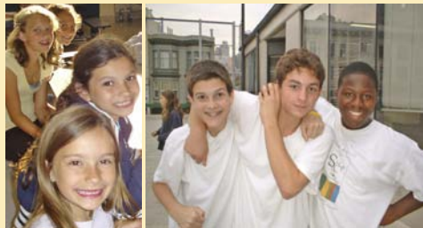
Young ideals stand tall as ever!